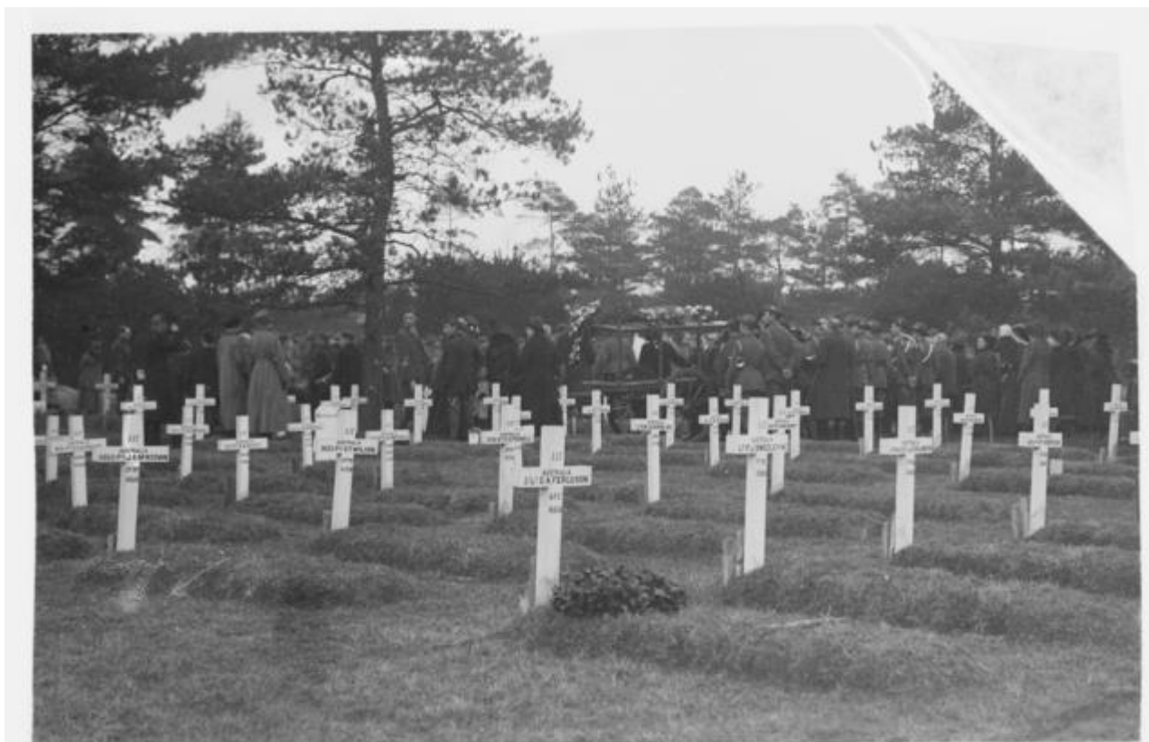
AUSTRALIAN WAR MEMORIAL

There are 446 Australian War Graves in Brookwood Military Cemetery – 351 from World War 1 & 95 from World War 2.