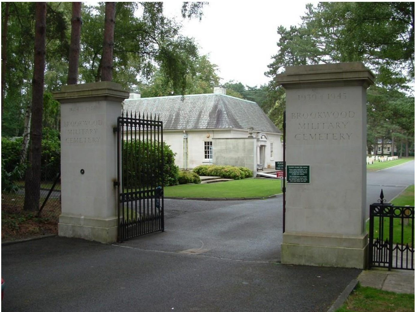
Brookwood Military Cemetery