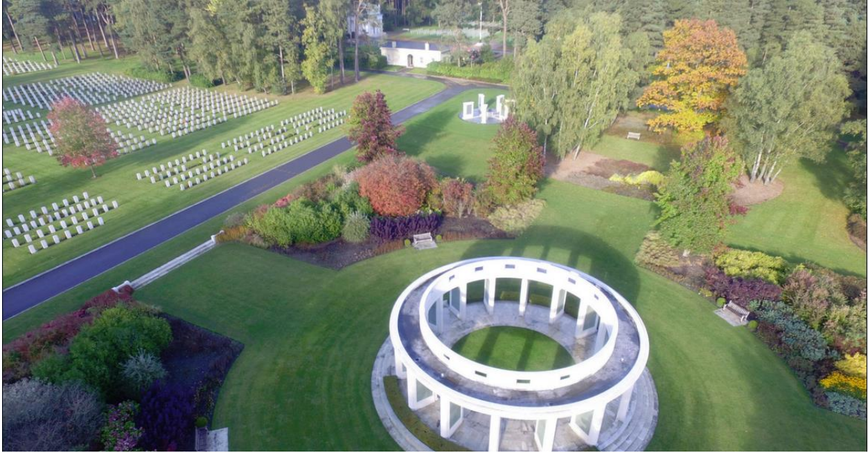
Brookwood Military Cemetery