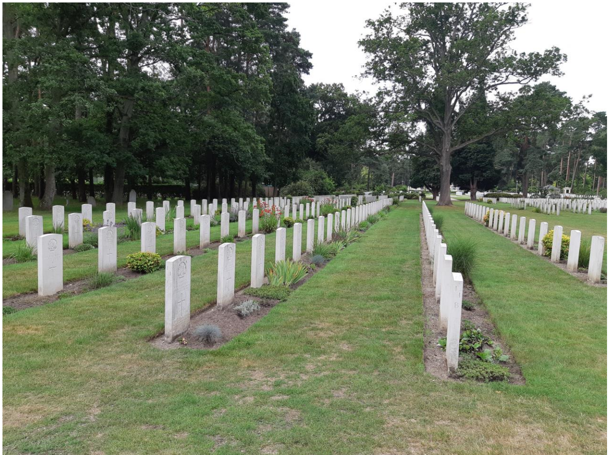
Australian War Graves