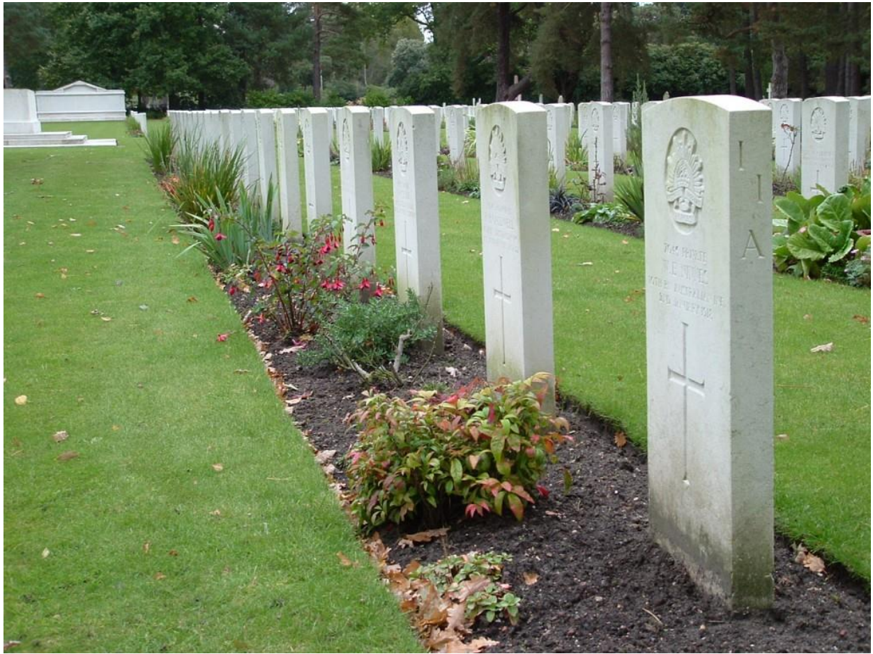
Australian Graves in Brookwood Military Cemetery